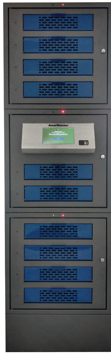
10 Locker Main Stack

AssetWatcher takes storage into the modern era. Built-in RFID technology enables you to recognize and track assets that have been placed in or removed from lockers. With the ability to support over 10,000 users, AssetWatcher tracks who removed or returned each asset and when it happened. Optional USB charging feature adds a USB port inside each locker so devices can be charged while they are safely locked away, and a biometric scanner lets users unlock assets with the scan of a finger. Three modes enable administrators to tailor use of AssetWatcher to specific needs. Perfect for hotels, schools, hospitals, casinos, and other high-security applications, AssetWatcher's flexibility and scalability make it ideal for a range of uses.