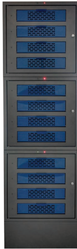
12 Locker Add-On Stack